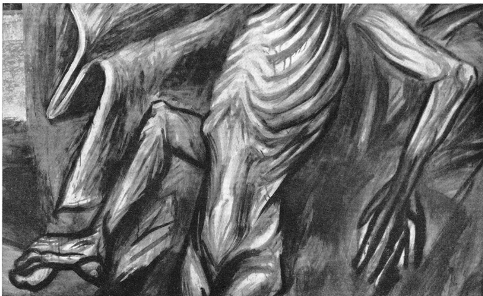
Orozco: APOCALYPSE, 1944, detail of the fresco in the Church of Jesus, Mexico City.

One should not prejudge that a belief in God would soothe the artist's frenzy. Of the type of faith that is conceived as a social appendage to gracious living, Orozco gave an unflattering comment in his "Father God," who holds a geographical globe instead of the medieval macrocosm, winks the rich into Heaven and shoos the poor off to Hell. Far from a salve, faith is for him a means of enlarging to God's size man's distresses, a point of view that coincides instinctively with the one cogent reason advanced by theology to usher in the Passion. Translating the Magnificat into Mexican terms—"He has humbled the proud and exalted the meek"—Orozco expects to witness in a next world the longest and best of all revolutions.